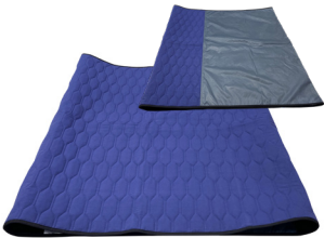
Unique Slide Royal