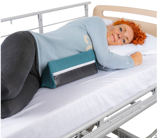
Regulation MDR 2017/745 for medical devices class 1