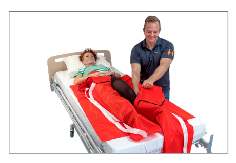
4. If the user cannot use either leg apply the Dress Master on both legs.