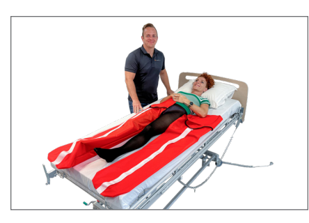
1. Place the Dress Master with the short side near the crotch, the long side outwards, and the pull straps on the outside.