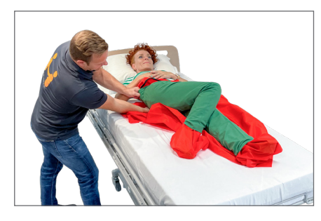
6. Make sure the trousers are pulled all the way up and straightened under the user before closing them.