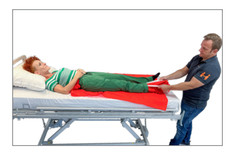
7. Remove the Dress Masters one at a time by pulling the two straps simultaneously.