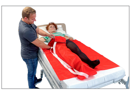
3. Slide the Dress Master over the foot and up along the leg. Make sure to place the sliding material all the way up under the user's pelvis.