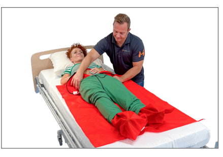
5. Maintain the Dress Master between the user's legs and the trousers while pulling the trousers up beneath the users pelvis.