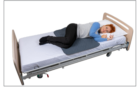
3. Inco Sheet Terry Cloth - XS Terry cloth top layer and soft and absorbent filling on top of a high quality incontinence membrane.