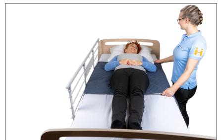
8. Turn the user to supine. The Inco Sheet is now placed correctly underneath the user.