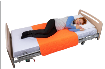
4. BASIC Inco - S Nice polyester/cotton surface and filling on top of a high quality incontinence membrane.