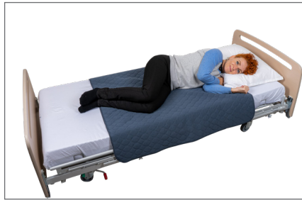
2. Inco Sheet - M Jersey top layer and soft and absorbent filling on top of a high quality incontinence membrane.