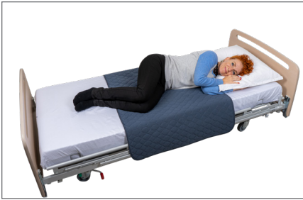
1. Inco Sheet - S Jersey top layer and soft and absorbent filling on top of a high quality incontinence membrane.