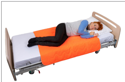
5. BASIC Inco - M Nice polyester/cotton surface and filling on top of a high quality incontinence membrane.