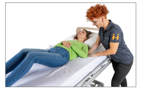
4. Place the hand in the Super Glide ECO fold. From the top slide the Super Glide under the user's shoulders - begin on one side and continue the same way on the other side.