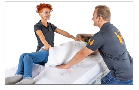
7. Turn the user to side lying. Helper A places the folded Super Glide ECO with the fold close to the spine. To achieve comfort and perfect working conditions a draw sheet could also be placed over the Super Glide ECO.