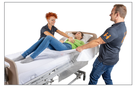
8. Return the user to supine lying. Helper B pushes the user to the side and Helper A pulls the draw sheet. The Super Glide ECO reduces friction enormously during the transfer.