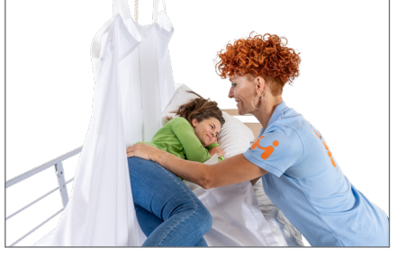
14. Mount the Multi Sheet on the opposite side to the hoist. Lift up, slide, and place the user in a perfect position using the Super Glide ECO. Thus reducing friction between the sheet and the Multi Sheet.