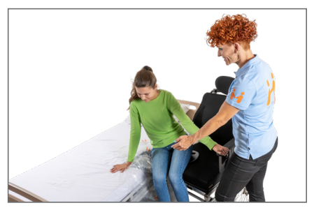
11. Place the Master Glide under the folded Super Glide ECO, to build the bridge and make the transfer easier. Remember to make use of the user's resources during the transfer.