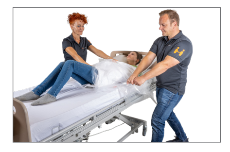
9. Remove the Super Glide ECO by pulling the lower part of the Super Glide ECO. You can also pull the fold in between the sides and let the ECO slide on itself.