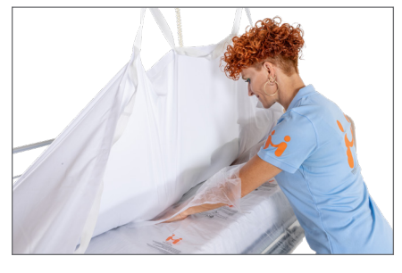
13. Mount the Multi Sheet on the hoist. Turn the user slightly to one side. Place the folded Super Glide ECO Open close to the spine. Make sure to place it under the pressure points of the head, shoulder, and buttocks.