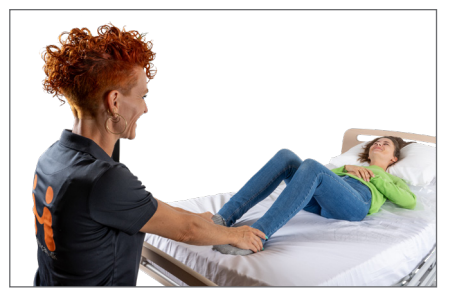
5. Elevate the bed end to use the gravity. Bend the user's legs, fixate the feet and ask the user to push the upper body upwards. Alternatively place the Super Glide ECO under the sheet and use this as a draw sheet.