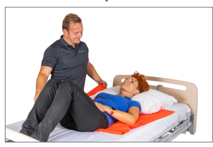
4. Place a piece of sliding material under the user's head, shoulders and if needed bottom. Bend the user's legs. Place the Mini Master under the user's pelvis with the non-slip/velour side towards the user.