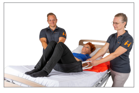
5. A helper on each side grabs the handle of the Mini Master. Ask the user to lift the pelvis if possible. Using weight transfer the helpers slide the user upwards in bed.