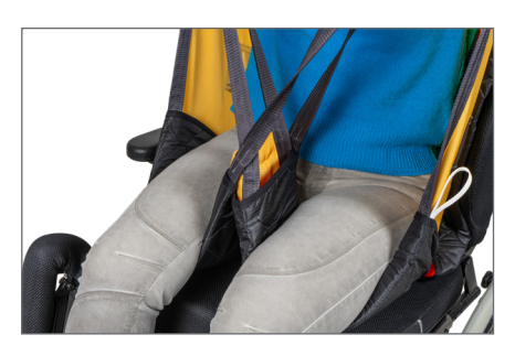
5. When lifting, the leg strap slides into place inside the Sling Sock under the user's leg. Thus, the user avoids shear and scraping of the skin due to the comfortable padding.