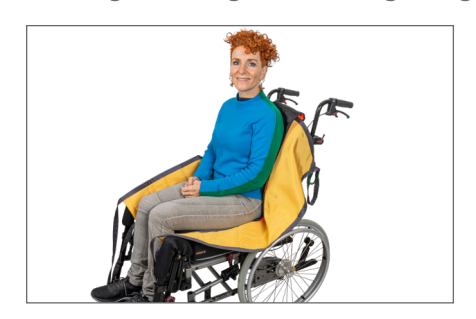
1. The sling sheet is placed behind the user's back. If it is difficult to place, a Sling Vest (MC 003-9040), Master Glide Thor (MC 001-7061) or Nylon Master can be used.