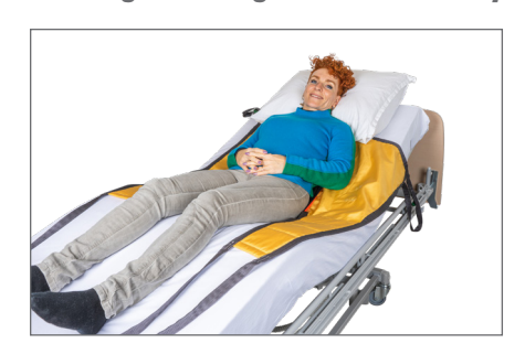
8. The sling sheet is placed behind the user's back. If it is difficult to place, a Sling Vest (MC 003-9040), Master Glide Thor (MC 001-7061) or Nylon Master can be used.