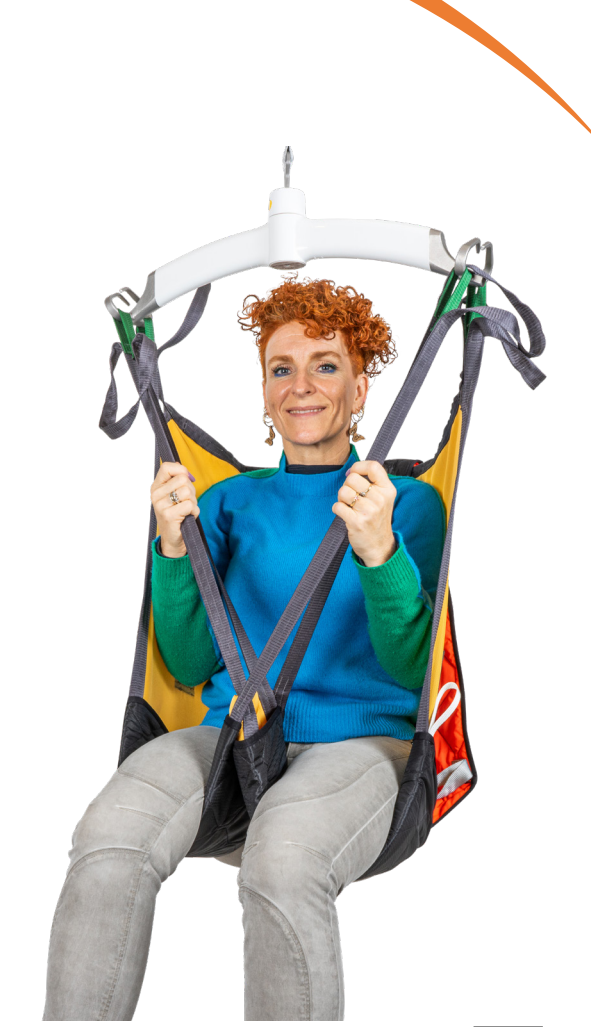
Regulation MDR 2017/745 for medical devices class 1