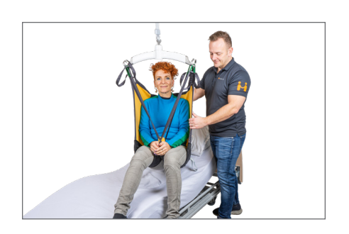
14. Elevate the bedrests for at seated position. Begin hoisting the user. The sling sheet slides into place under the user without shear or scraping of the skin.