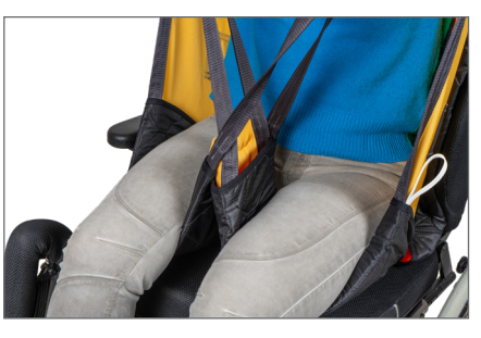
5. When lifting, the leg strap slides into place inside the Sling Sock under the user's leg. Thus, the user avoids shear and scraping of the skin due to the comfortable padding.