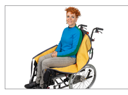
1. The sling sheet is placed behind the user's back. If it is difficult to place, a Sling Vest (MC 003-9040), Master Glide Thor (MC 001-7061) or Nylon Master can be used.

Placing the sling sheet using Sling Socks. Seated user – 1 helper: