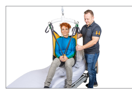
14. Elevate the bedrests for at seated position. Begin hoisting the user. The sling sheet slides into place under the user without shear or scraping of the skin.