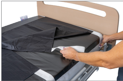
13. Helper B grips the Master Turner. Helper A pulls out the straps and fix them to the cover.