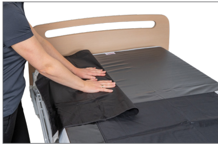
10. Helper B folds the flap and places their hands on the fold.