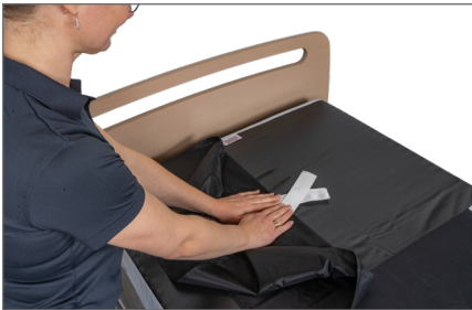
12. The straps are tucked on top of the gliding flap and under the user's cavities - neck, lower back, the knees, and over the heels.