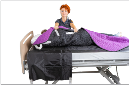
9. Helper A takes hold of the Master Turner and tightens it around the user's body.