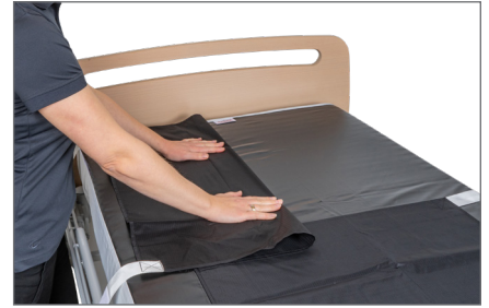
11. Helper B slides the middle of the flap underneath the user. Smooths it out towards the sides.