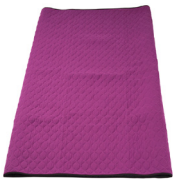
Unique Slide - L Slide Master Terry Cloth - L