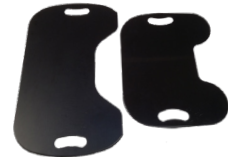
Master Glide Senior