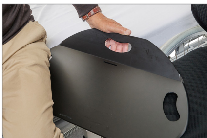
7. To avoid sliding bumping into the wheel and to make the board more stable bend up the back edge of the Master Glide.