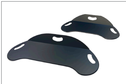
5. Master Glide Viking This sliding board has the same properties as the Master Glide Flexi but is adjusted to users with shorter legs.