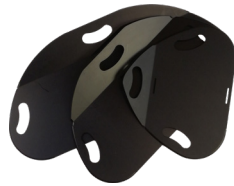
Master Glide Flexi