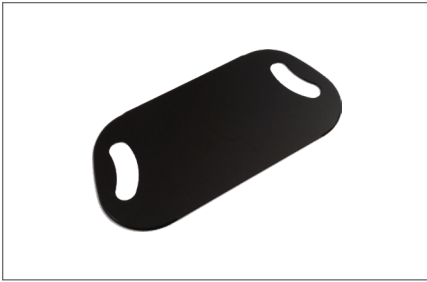
1. Master Glide Junior The small, light, and flexible transfer board for short distances or user's with a high level of mobility.