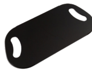
Master Glide Junior