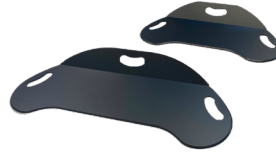
Master Glide Viking