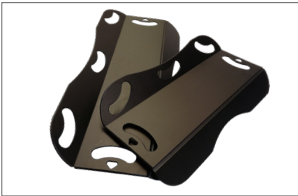
4. Master Glide Multi You can bend both the front and rear edge of this multi-functional sliding board to make it fit around the wheelchair wheel and/or short legs. When bending the edges, the board is made more stable.