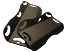
Master Glide Multi