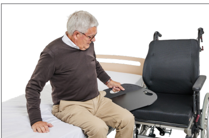
6. Sitting on the edge of the bed the user grabs the middle handle of the Master Glide, leans to the side, and slides the board under the buttock.