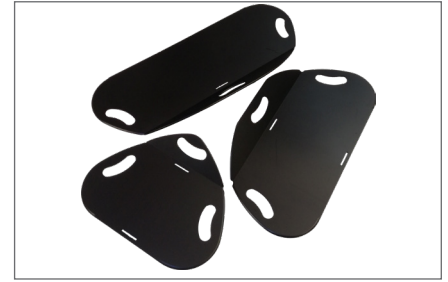
3. Master Glide Flexi Make this flexible sliding board stiffer by bending up the rear edge prior to a transfer.