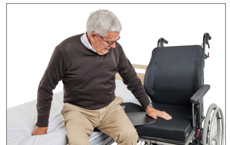
8. The user leans towards the Master Glide to shift the weight over to the board. Use one hand to keep the upper body stable on the Master Glide while transferring slowly towards the wheelchair.