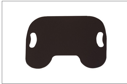
2. Master Glide Senior The sliding board that makes room for the wheelchairs tire.