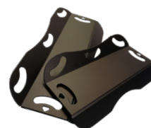
Master Glide Multi