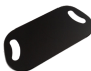
Master Glide Junior