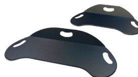
Master Glide Viking