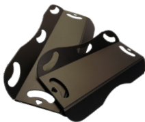
Master Glide Multi