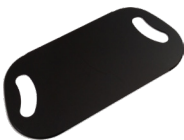
Master Glide Junior