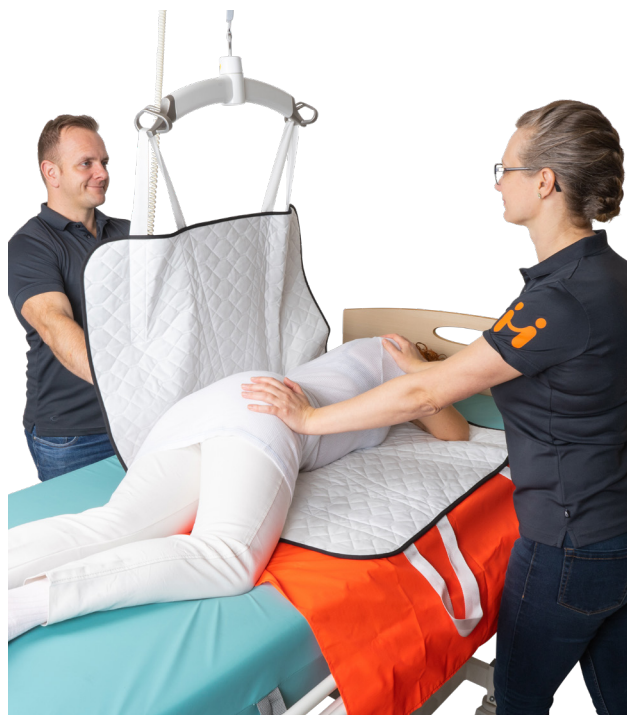
Regulation MDR 2017/745 for medical devices class 1